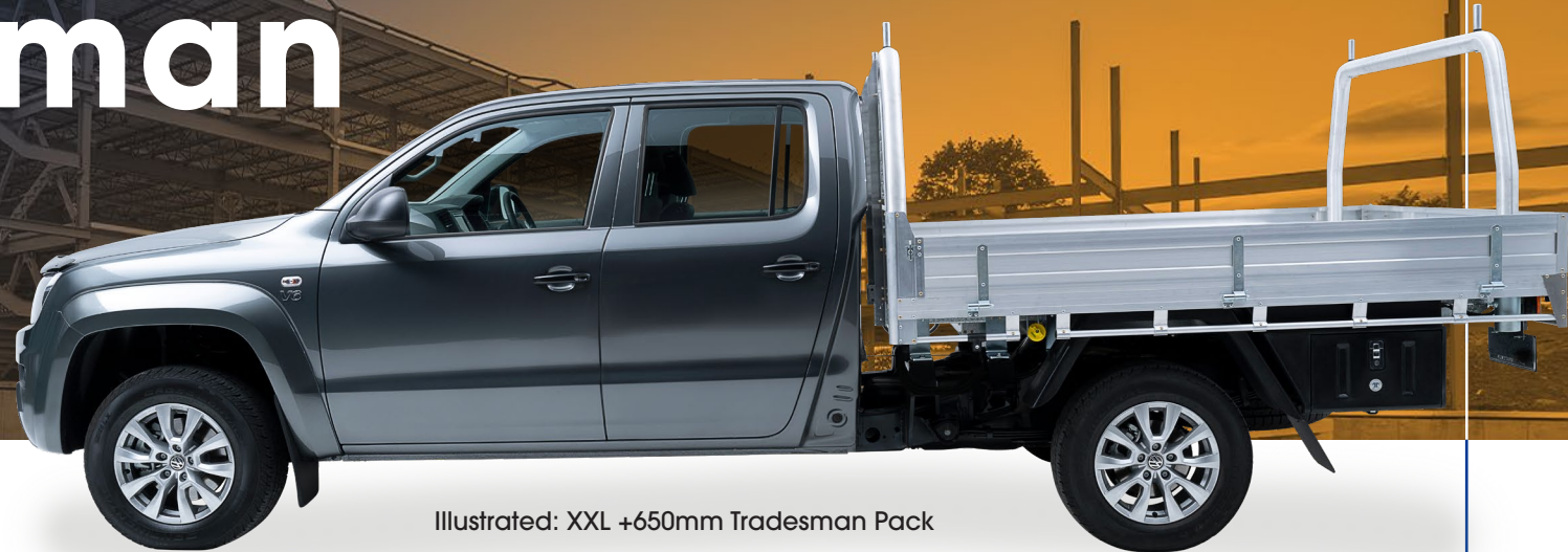
Illustrated: XXL +650mm Tradesman Pack