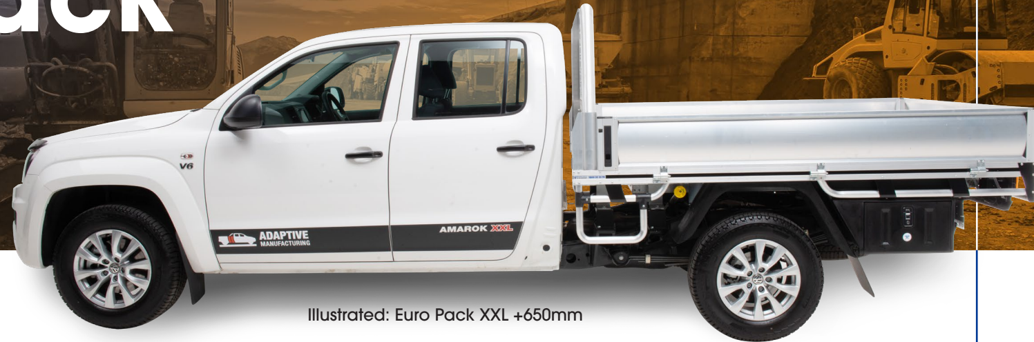
Illustrated: Euro Pack XXL +650mm