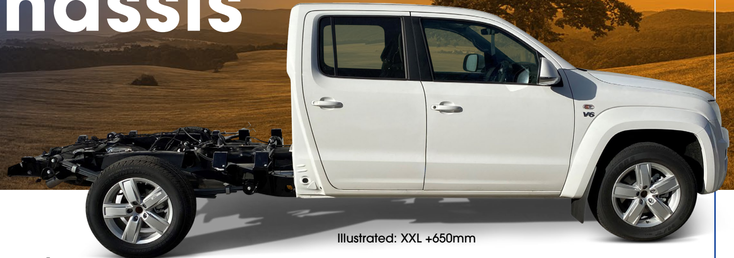
Illustrated: XXL +650mm